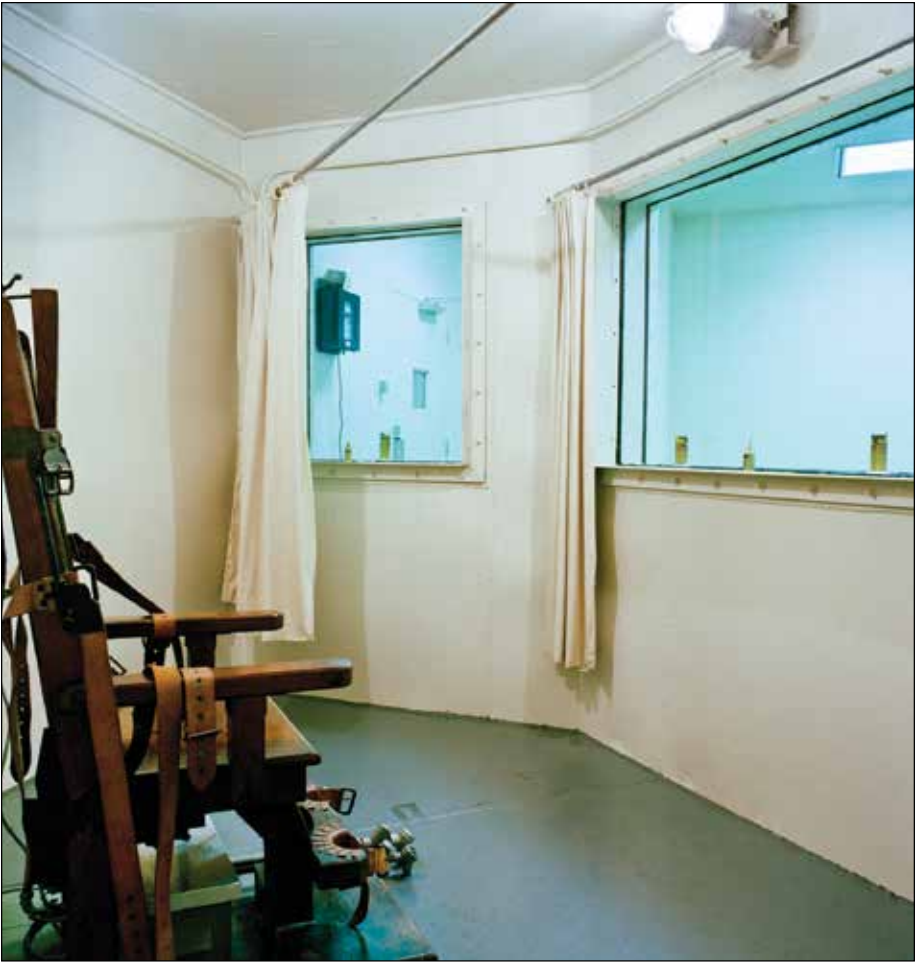
Gas Chamber, The Omega Suites © Lucinda Devlin

“Victim's perspectives, taken holistically, make a compelling case against the death penalty. When it comes to the death penalty, almost everyone loses.”